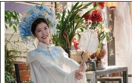
浔埔村 ~ 簪花服饰体验

备注： 行程若更改，需受公司的条款与细则所约束。顾客需注意以下事项：在公司无法控制的情况下行程可能更改。 指定城市的住宿需视客房供应情况而定。行程顺序可能更改。不同团体可能合并成一团。 若有更改不被接受，需遵守条款与细则中的退款规定。