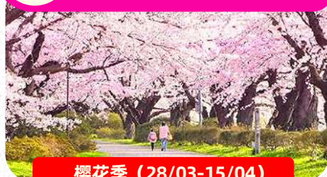
樱花季 (28/03-15/04) CHERRY BLOSSOM SEASON (28/03-15/04)

韩国首个西式公园，以纪念韩美友谊而建，春季樱花盛开时尤为迷人，是赏花与休闲的好去处。