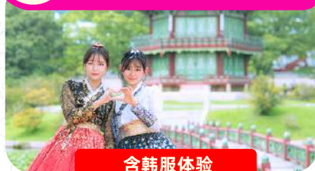
含韩服体验 HANBOK FITTING EXPERIENCE

景福宫是首尔最具代表性的古代宫殿，融合传统建筑与悠久历史，可穿韩服漫步，感受古典魅力。