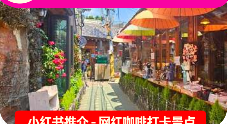
小红书推介 - 网红咖啡打卡景点 RECOMMENDED BY XIAOHONGSHU - TRENDY CAFÉ

融合传统与现代的独特村落，保存着经典韩屋建筑，拥有独特的文化氛围，成为热门的拍照和休闲打卡地。