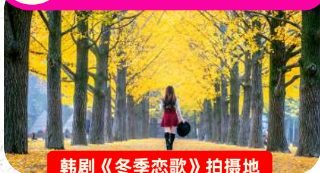
韩剧《冬季恋歌》拍摄地 WINTER SONATA FILMING SPOTS

四季皆美：春樱花、夏绿荫、秋红枫、冬雪景。浪漫步道和文艺小店吸引情侣与家庭游客。