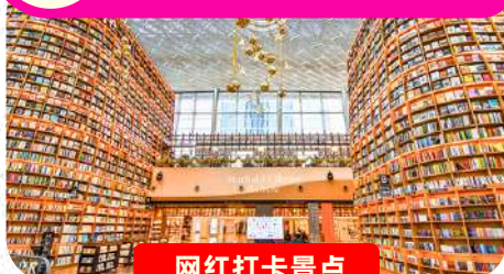
网红打卡景点 INSTAGRAMMABLE SPOT

一座融合现代设计的开放式公共图书馆，高达13米的书墙成为网红打卡地，吸引无数游客拍照与阅读。