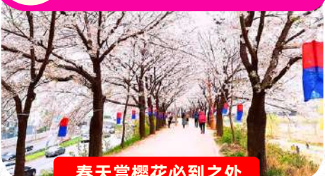
春天赏樱花必到之处 A SPRING MUST-VISIT SPOT

春天必访的赏樱胜地，樱花绽放时形成浪漫的花海步道，吸引了众多游客前来拍照与漫步。