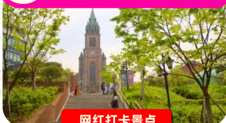
网红打卡景点 INSTAGRAMMABLE SPOT

明洞大教堂是韩国第一座哥特式天主教堂，具有深厚的历史与文化意义，是明洞地区的标志性建筑和热门打卡点。