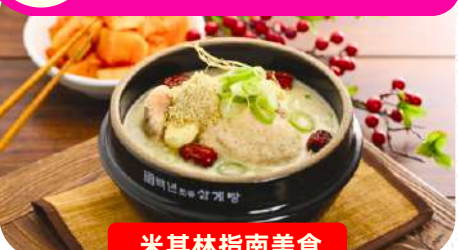
米其林指南美食 MICHELIN GUIDE CUISINE

品尝各种米其林指南美食如：高丽参鸡汤，满足五香猪蹄料理，明洞饺子+拉麵料理等等。