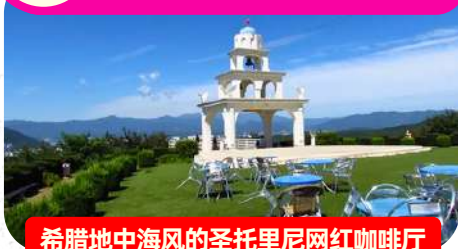
希腊地中海风的圣托里尼网红咖啡厅 SANTORINI-STYLE MEDITERRANEAN CAFÉ

以希腊地中海风格的圣托里尼网红咖啡厅而闻名，白墙蓝顶的设计宛如置身海外，是拍照与休闲的热门去处。