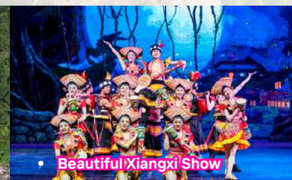
• Beautiful Xiangxi Show