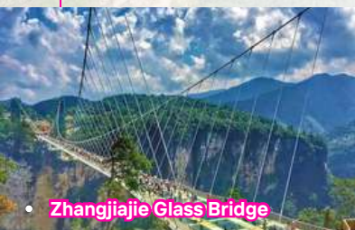
• Zhangjiajie Glass Bridge