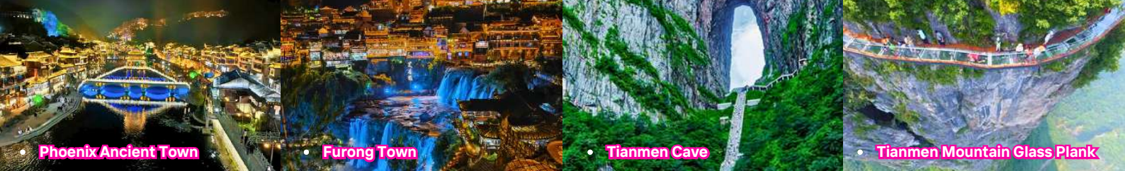
• Phoenix Ancient Town