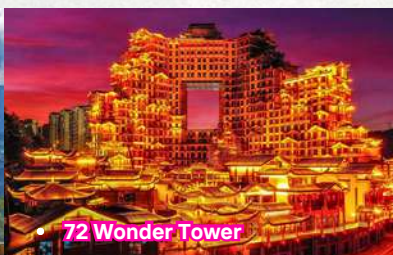
• 72 Wonder Tower