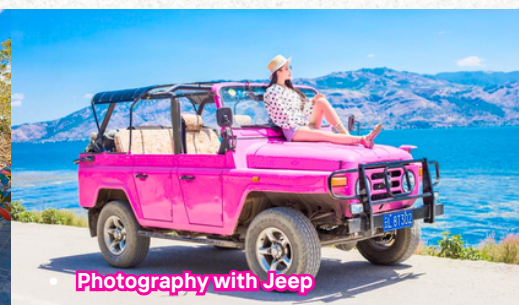
• Photography with Jeep

*Itinerary, dining, and accommodation arrangements are subject to final confirmation by the local ground operator based on actual weather conditions.