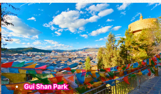
• Gui Shan Park