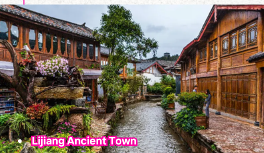
• Lijiang Ancient Town