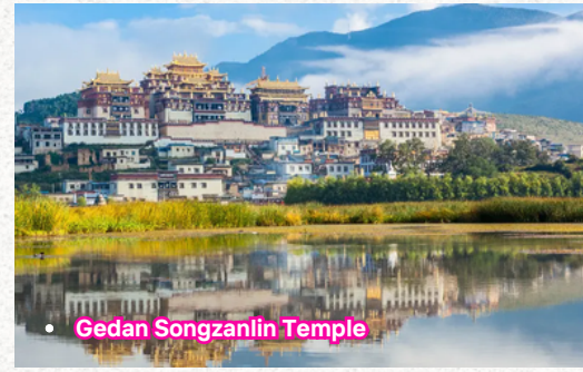
• Gedan Songzanlin Temple