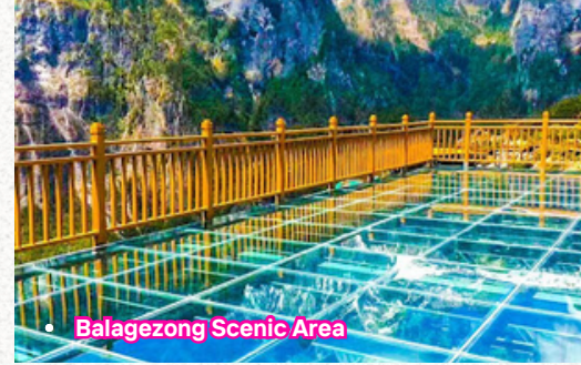
• Balagezong Scenic Area