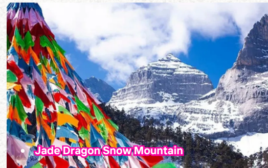
• Jade Dragon Snow Mountain