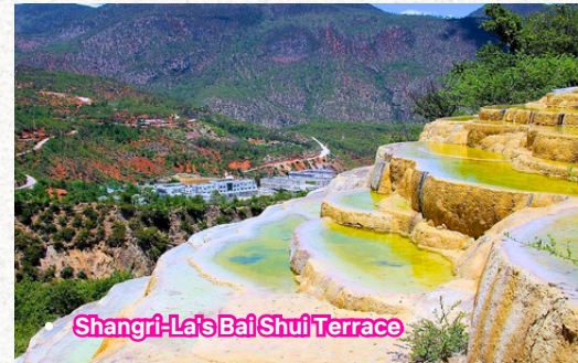
• Shangri-La's Bai Shui Terrace