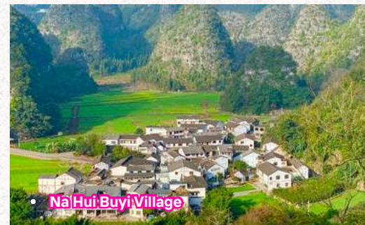
Na Hui Buyi Village