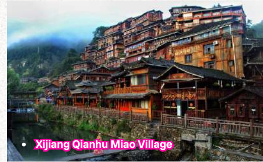
Xijiang Qianhu Miao Village