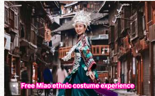
Free Miao ethnic costume experience

Optional Tour: 「Longli Water Town + Gui show」 OR 「Colorful Guizhou Style Performance」 RMB298/pax