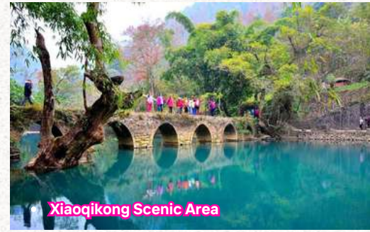
Xiaoqikong Scenic Area