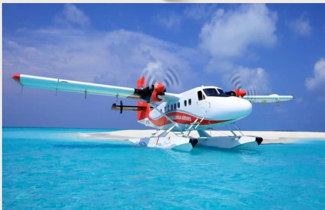
Airport transfer by Seaplane 水上飞机机场接送