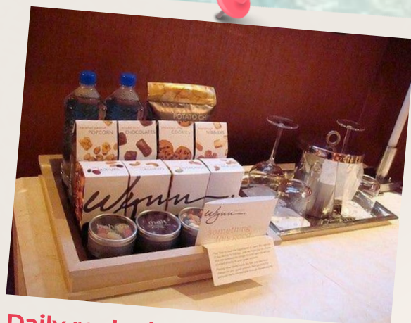
Daily replenished minibar service 每日补充迷你吧服务