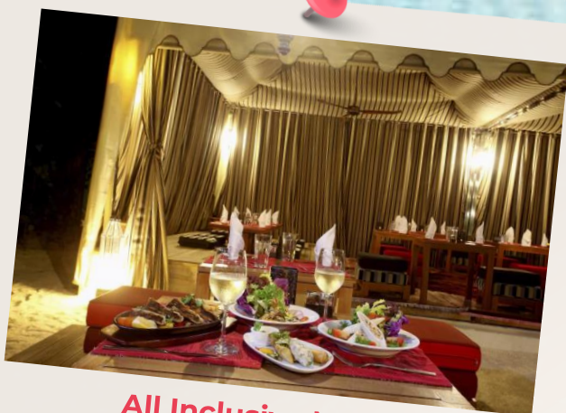
All Inclusive Meal 全包餐