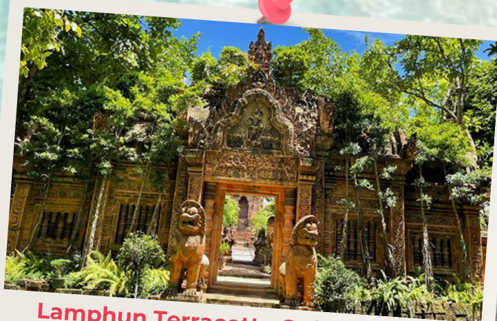
Lamphun Terracotta Coffee Garden 南奔Terracotta咖啡館