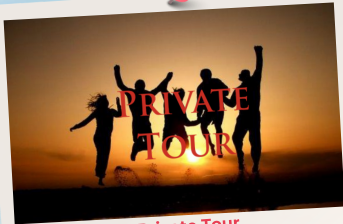
Private Tour 專屬私人團