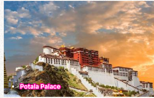
• Potala Palace