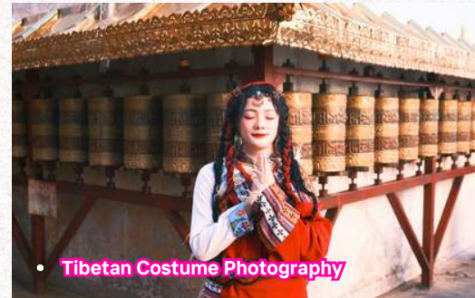
• Tibetan Costume Photography