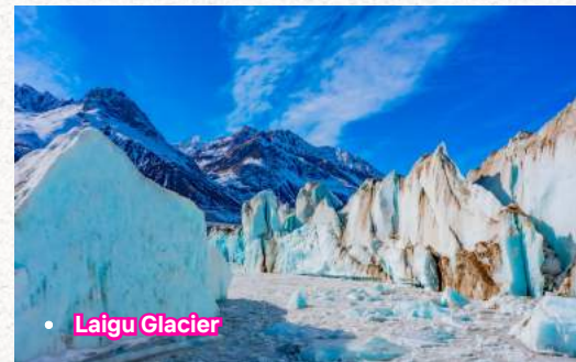
• Laigu Glacier