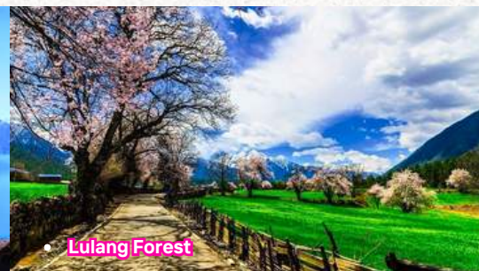
• Lulang Forest