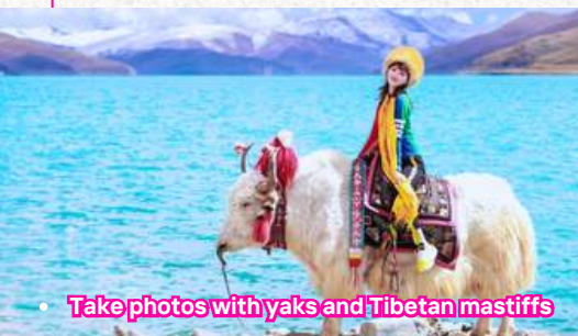
• Take photos with yaks and Tibetan mastiffs