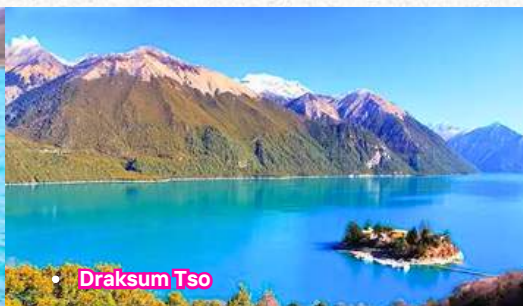
• Draksum Tso