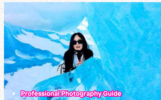
• Professional Photography Guide