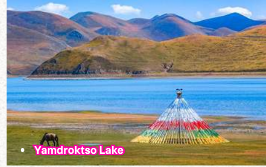
• Yamdroktso Lake