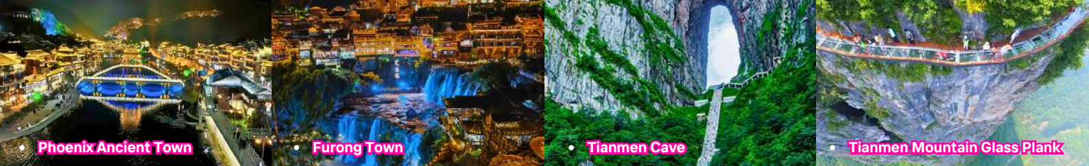
• Phoenix Ancient Town