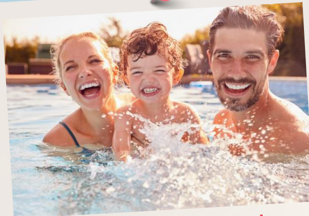
Family Friendly Resort 家庭和乐度假村