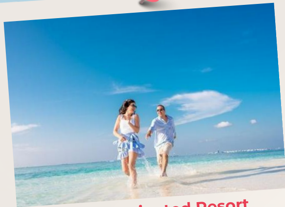
Adult Oriented Resort 仅限成人度假村