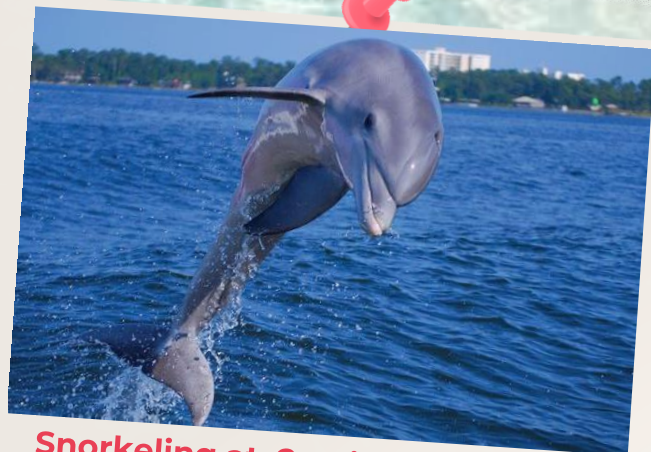
Snorkeling at 2 point & Dolphin Watching Cruise 浮潜 & 观望海豚船