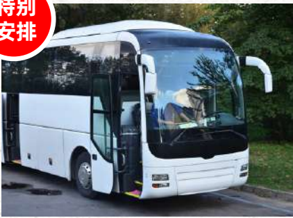
尊享体验 2+1 VIP游览巴士

SPECIAL ARRANGEMENT VIP Premium 2+1 Executive Coach