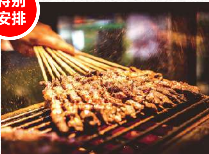
峨眉自助烧烤 + 酒水任喝

SPECIAL ARRANGEMENT Emeishan BBQ Buffet + Free-flow Drinks