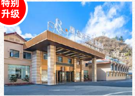
升级2晚全新五钻 九寨沟丽呈华廷度假酒店

SPECIAL UPGRADE 2NIGHTS Brand-new 5-star : Jiuzhaigou Licheng Huating Resort