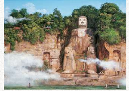
世界文化遗产之一 乐山大佛 (含船游)

Jiuzhaigou Scenic Area: UNESCO World Heritage Site and National 5A-Level Tourist Attraction