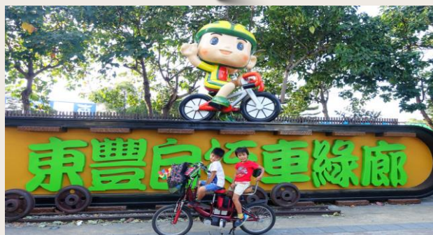
東豐自行車綠廊 DongFeng Bikeway