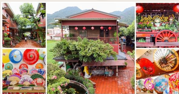
美浓民俗村 Meinong Folk Village