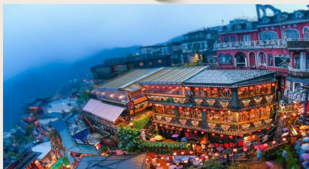
九份老街 Jiufen Old Street