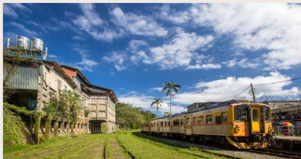
菁桐老街~平溪小火車 Qingting Old Street~Pingxi Train