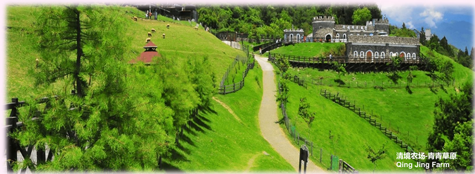
清境农场-青青草原 Qing Jing Farm