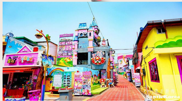
松月洞童话村 Songwol-Dong Fairy Tale Village