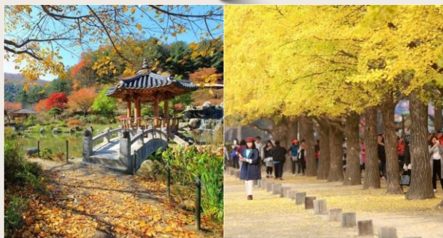
南怡岛 Nami Island