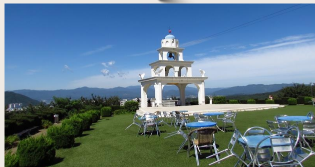
九峰山咖啡街 Gubongsan Coffee Street