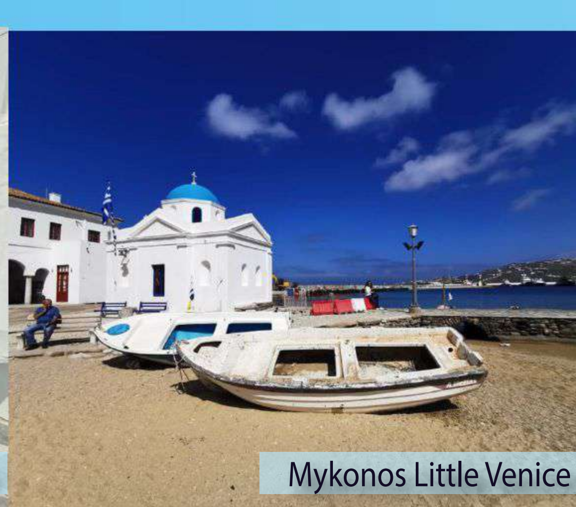
Mykonos Little Venice