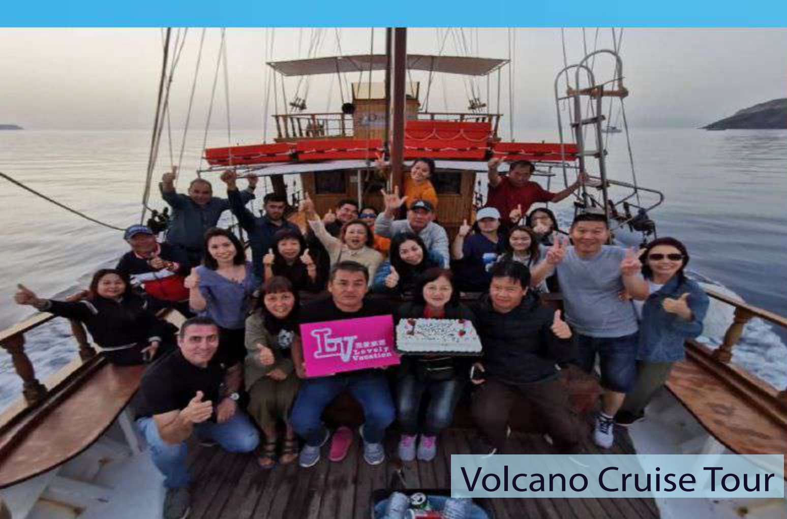
Volcano Cruise Tour