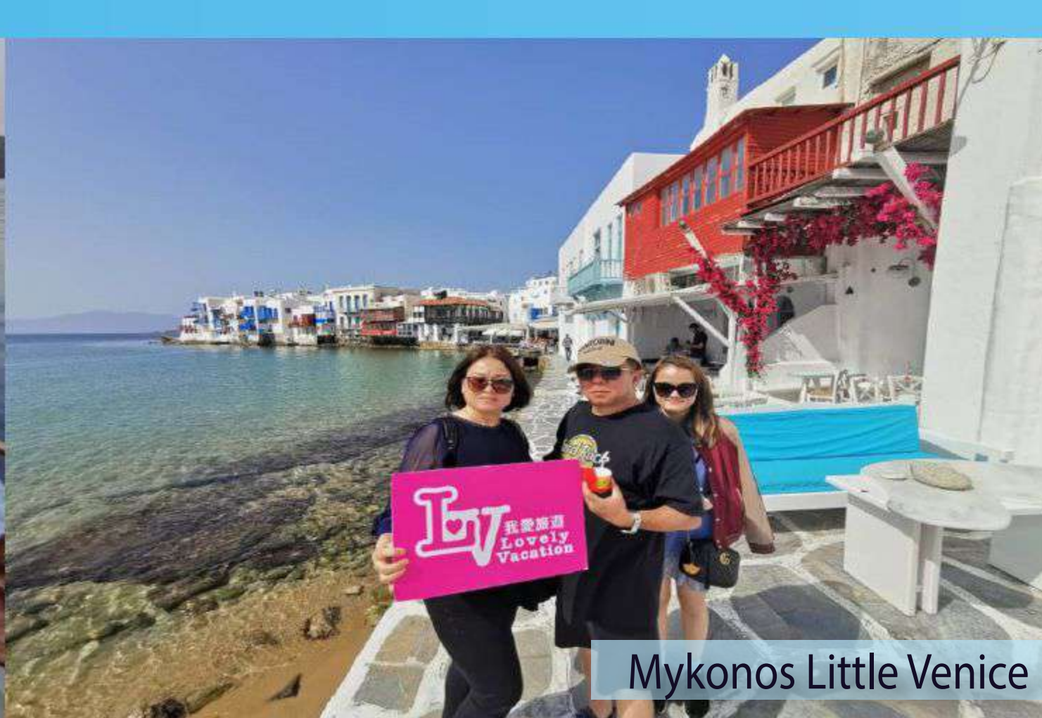
Mykonos Little Venice