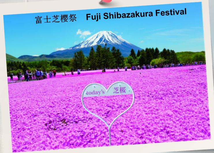
富士芝樱祭 Fuji Shibazakura Festival