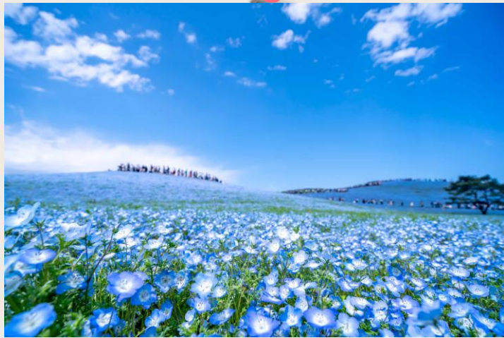
Hitachi Seaside Park 日立海滨公园