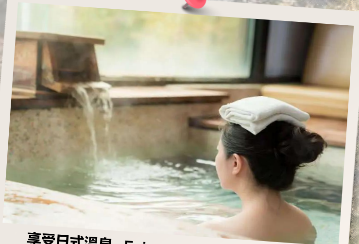
享受日式温泉 Enjoy Japanese onsen