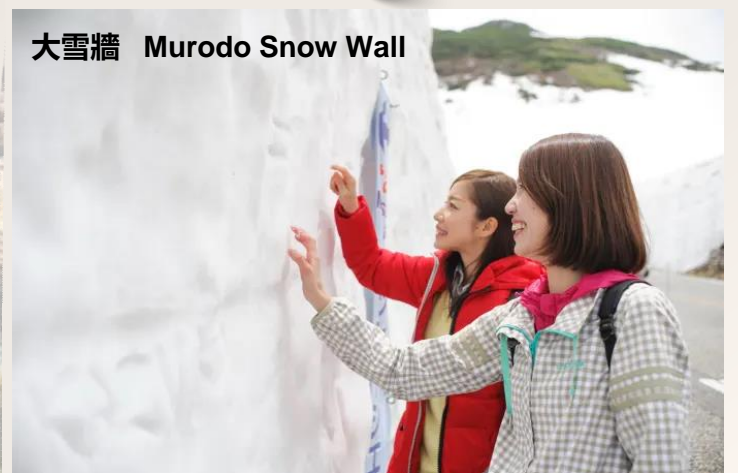
大雪牆 Murodo Snow Wall