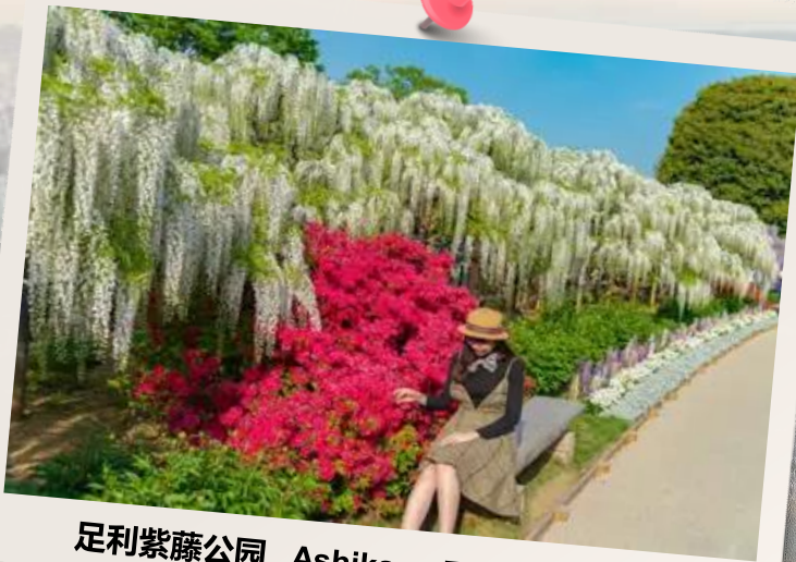
足利紫藤公园 Ashikaga Flower Park