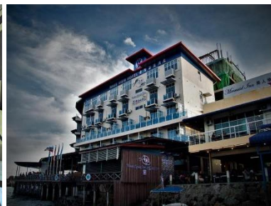
Wave View Hotel