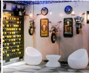
Neo Paly Hotel