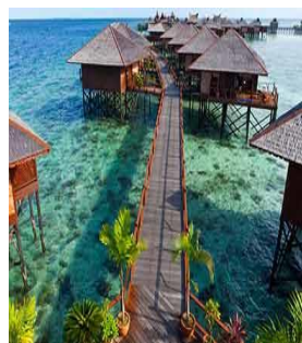
Sipadan Mabul Water Bungalow Resort