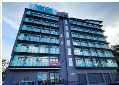
Grace Haijing Hotel