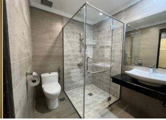
Wing Tat Grand Hotel