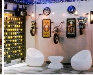
Neo Paly Hotel