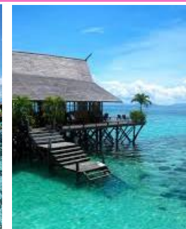
Kapalai Dive Resort