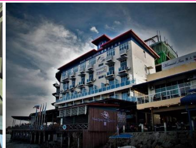
Wave View Hotel