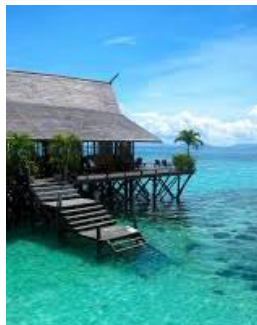
Kapalai Dive Resort