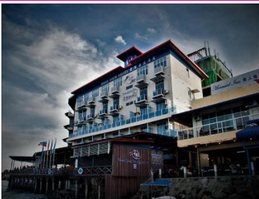
Wave View Hotel