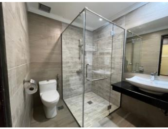
Wing Tat Grand Hotel