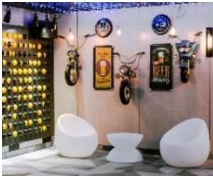
Neo Paly Hotel