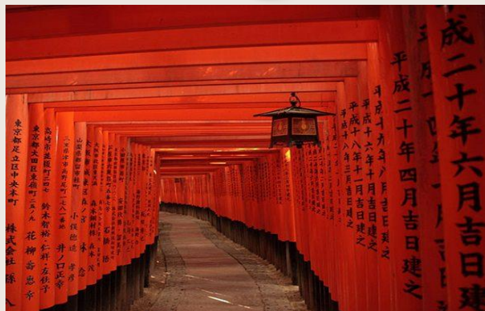
Fushimi Inari Shrine 伏见稻荷神社