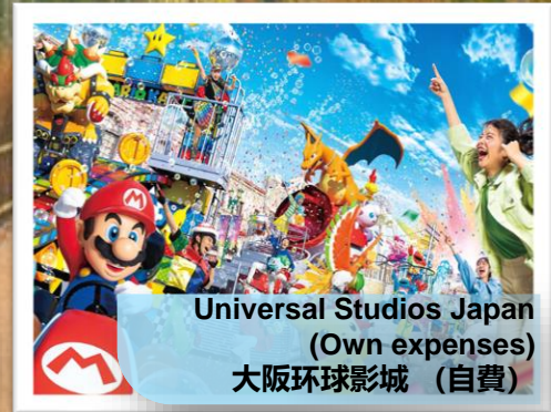
Universal Studios Japan (Own expenses) 大阪环球影城 (自費)