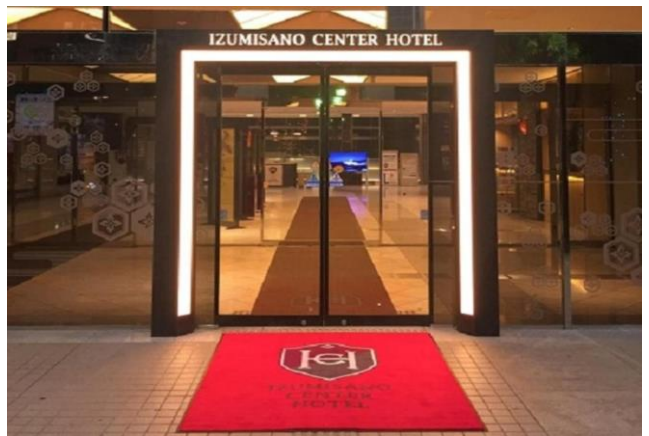
1N Izumisano Center Hotel or similar class