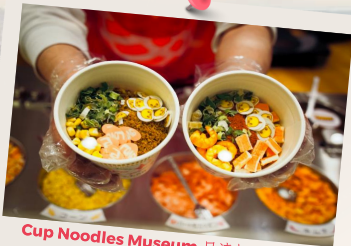
Cup Noodles Museum 日清杯面博物馆