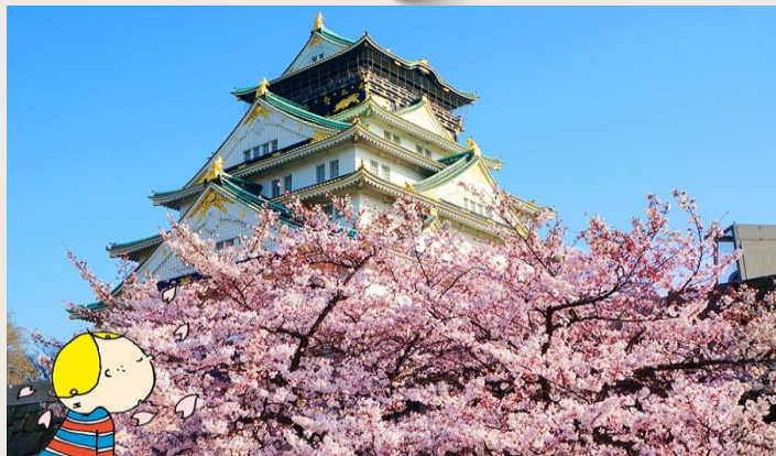
Osaka Castle 大阪城