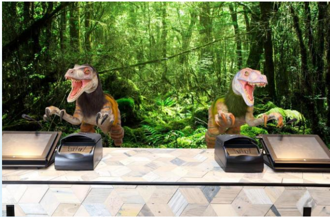
3N Henna Hotel Shinsaibashis or similar class