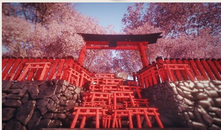
Fushimi Inari Shrine 伏见稻荷神社