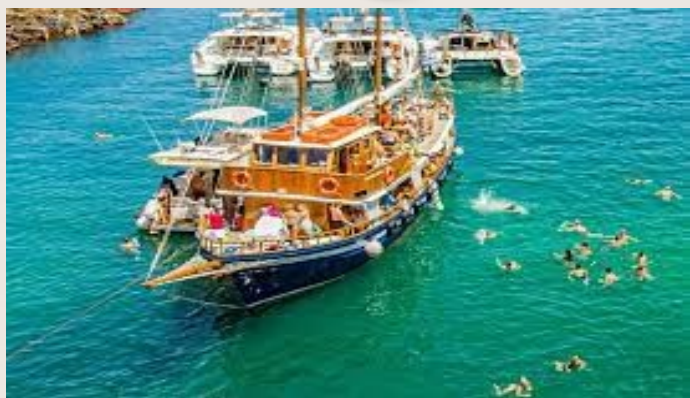
Santorini Volcano Cruise (Optional) 圣托里尼乘船游览 (自费)