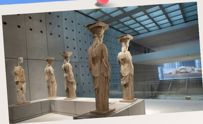
New Acropolis Museum 卫城博物馆