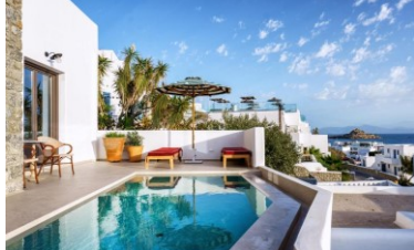
Mykonos 4* Pelican Hotel or similar