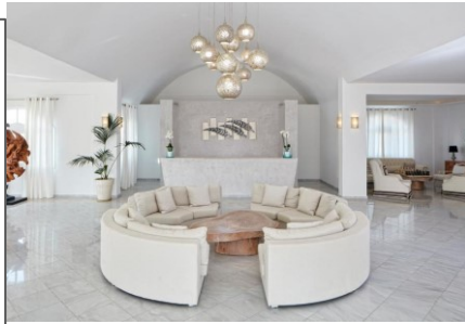
Santorini 4* El Greco Hotel or similar