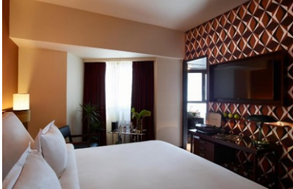
Athens 4* Brown Acropol Hotel or similar