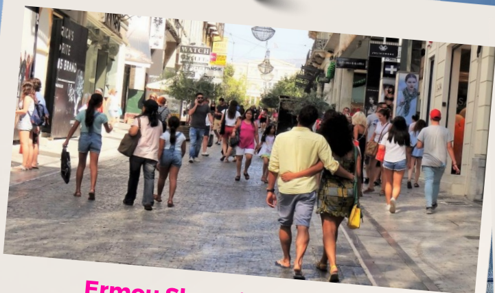
Ermou Shopping Street Ermou购物街