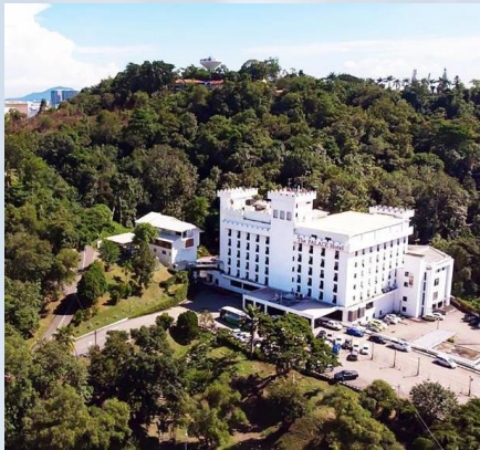
The Palace Hotel Kota Kinabalu