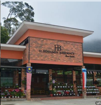
H Benjamin Hotel Kundasang