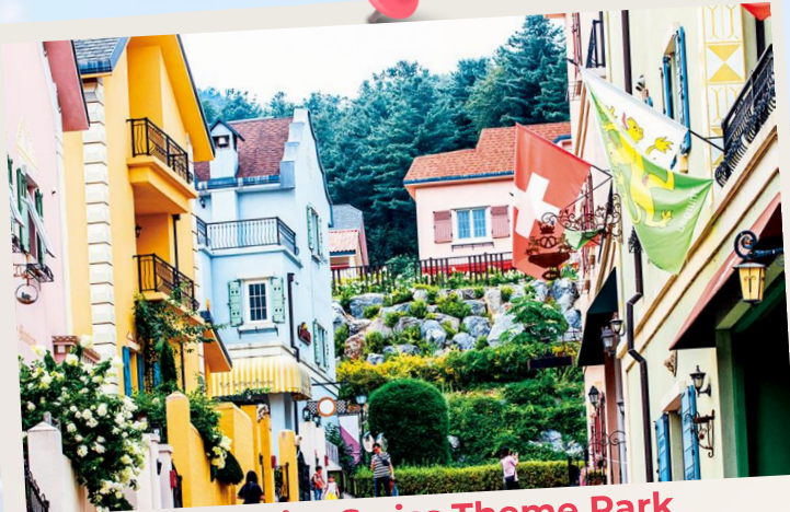
Edelweiss Swiss Theme Park 迷你版阿尔卑斯山的瑞士风景