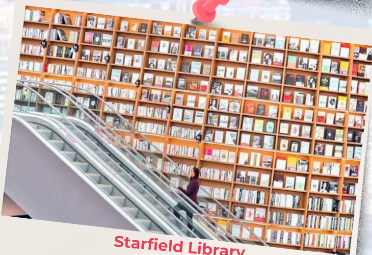
Starfield Library 星空图书馆