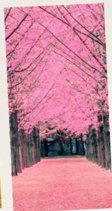
Nami Island 南怡岛