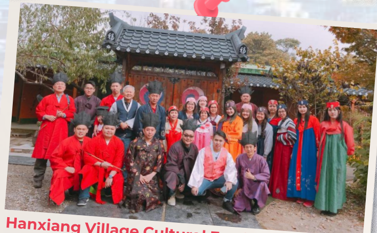
Hanxiang Village Cultural Experience Center 韩香亭农村文化体验馆 (参观人参田+人参奶品尝+泡菜DIY+韩服试穿)