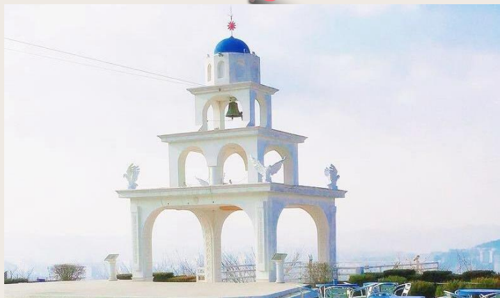
Gubongsan Observatory (Santorini Cafe) 九峰山咖啡接 (希腊地中海风圣多里尼咖啡厅)