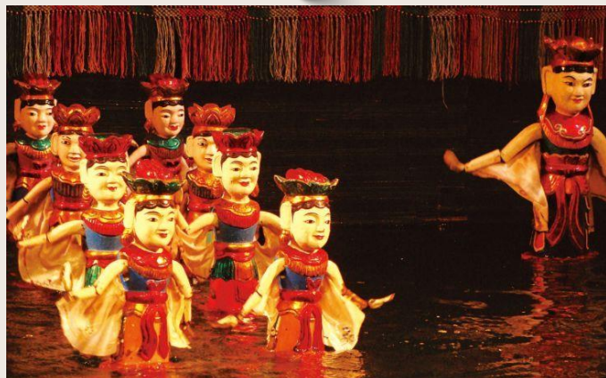
Water Puppet Show