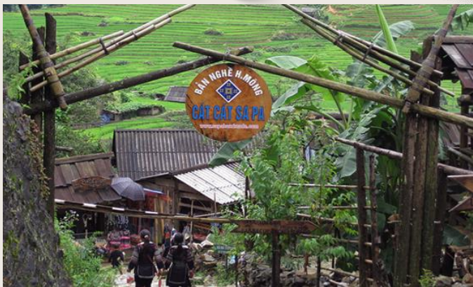
Cat Cat Village