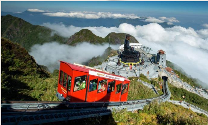
Fansipan by Muong Hoa mountain train and Cable car