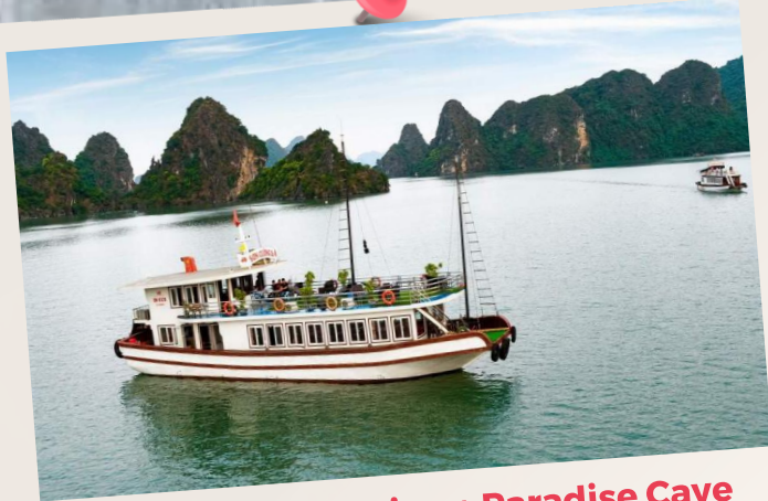
Ha Long Bay Cruise + Paradise Cave