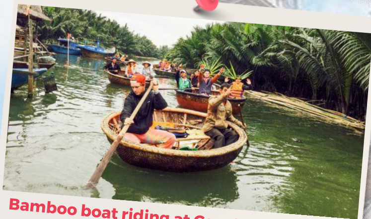
Bamboo boat riding at Cam Nam Coconut Village