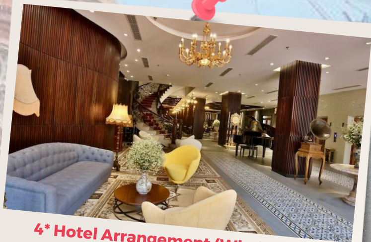
4* Hotel Arrangement (Whole Trip)