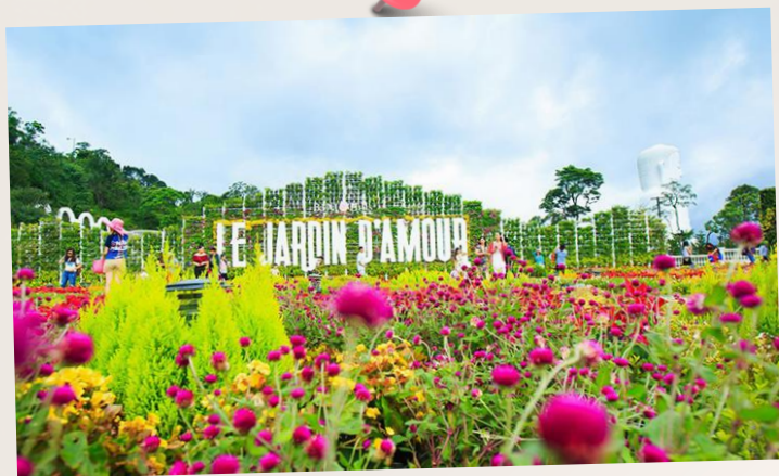
Le Jardine D'amour