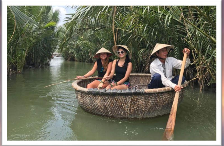
Special Arrange: Bamboo Boat Ride