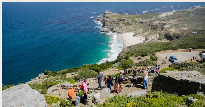
Cape Point 开普角