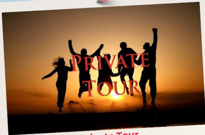
Private Tour 专属私人团