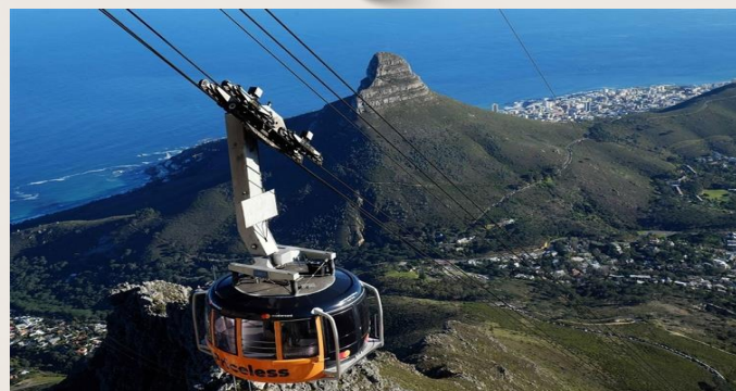
Table Mountain Aerial Cableway (Ride Ticket included) *Weather Permitting 桌山旋转登山缆车 (含缆车票) *视天气而定