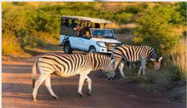
Pilanesberg National Park 匹林斯堡国家公园