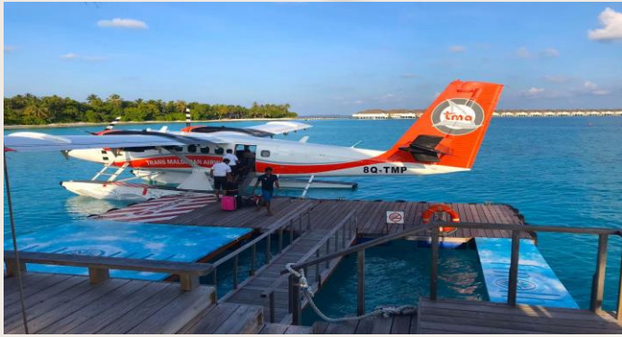
Domestic Flight & speedboat transfer