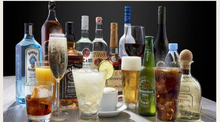
Unlimited Alcohol Drinks