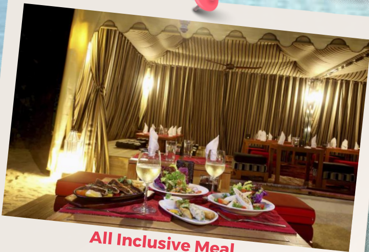
All Inclusive Meal