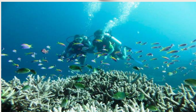
Complimentary Non-motorized Water Sport & Snorkeling Equipment