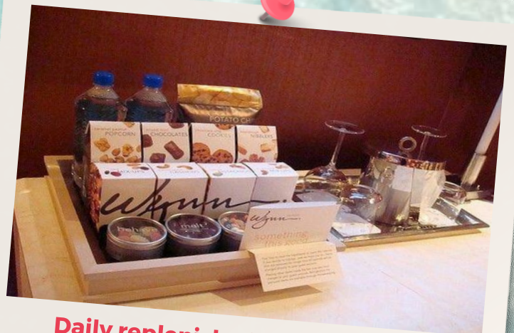
Daily replenished minibar service