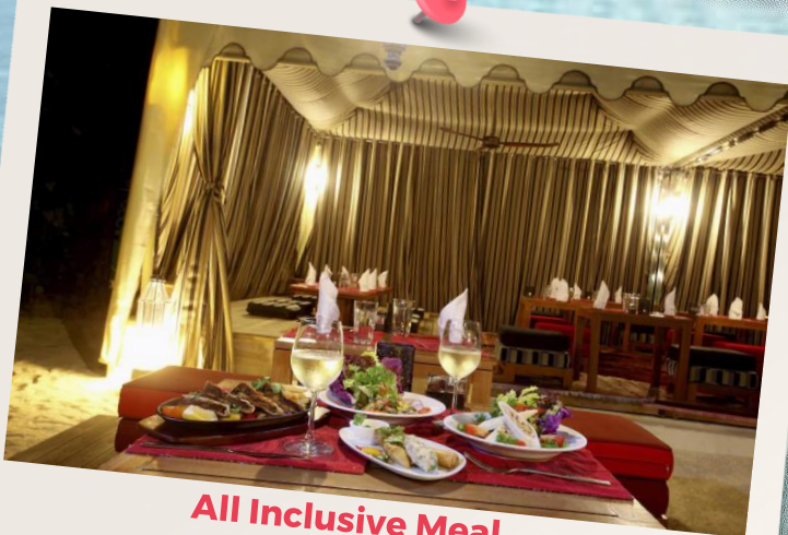
All Inclusive Meal