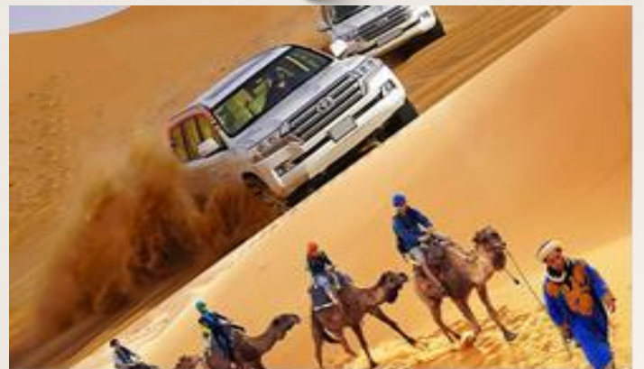
Sahara Desert Safari with camel ride 撒哈拉沙漠及体验骑骆驼