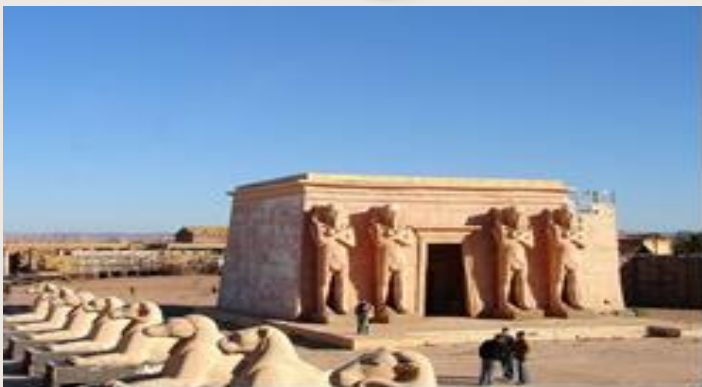
Atlas Film Studio 阿特拉斯电影工作室