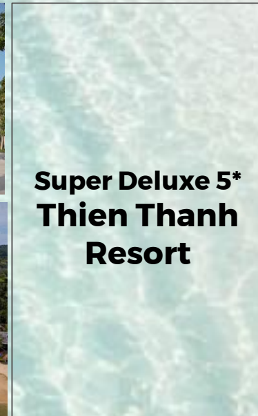
Super Deluxe 5* Thien Thanh Resort