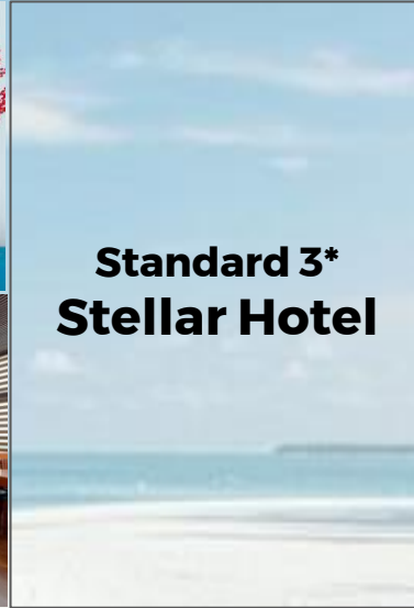
Standard 3* Stellar Hotel