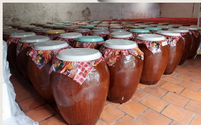
Sim Winery 桃金娘酒厂