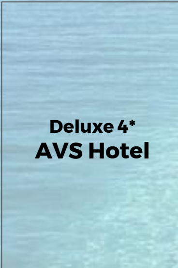
Deluxe 4* AVS Hotel