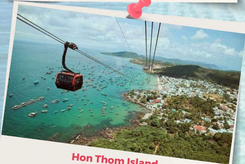
Hon Thom Island 菠萝岛