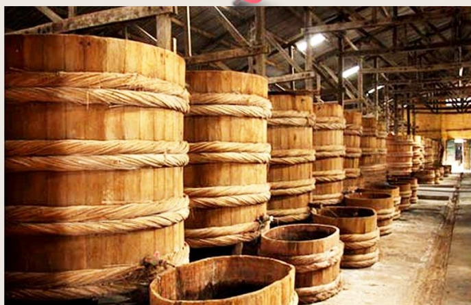
Phu Quoc Fish Face Factory 富国岛雨露厂