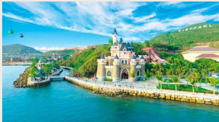
Vinpearl Land 珍珠游乐园