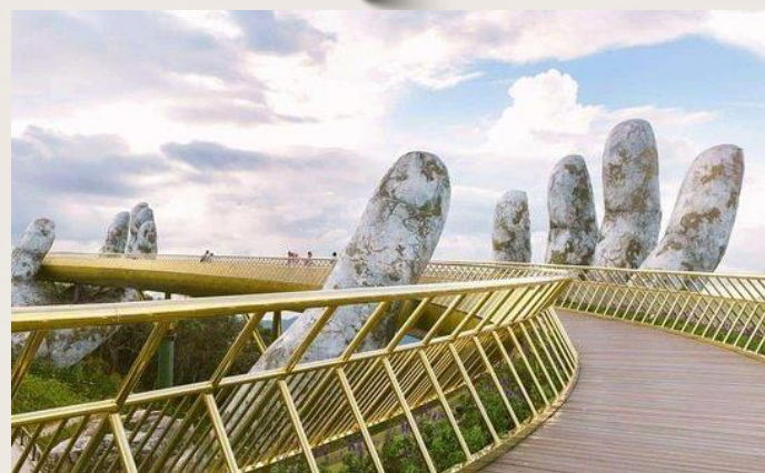
Golden Hand Bridge 佛手金桥