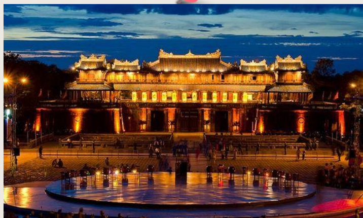
Royal Citadel 顺化皇城