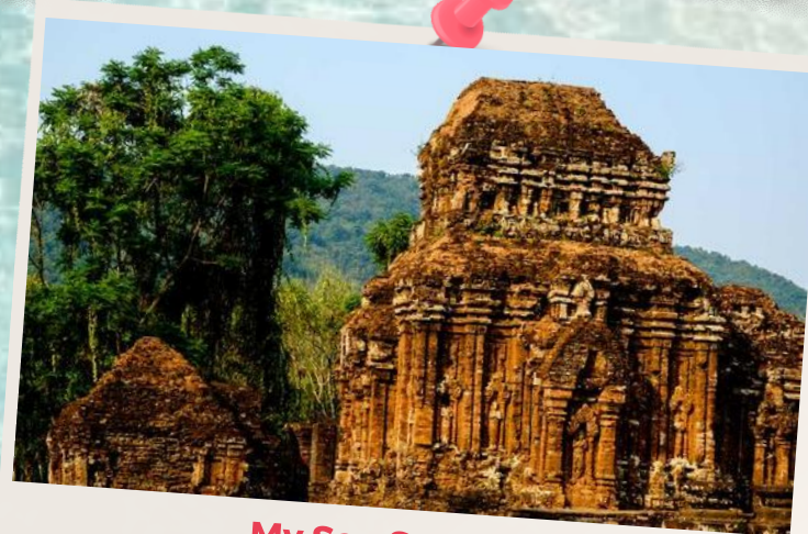
My Son Sanctuary 美山圣地