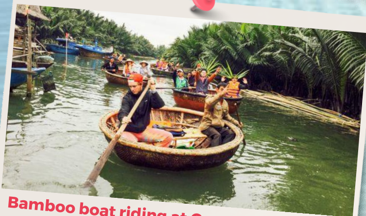
Bamboo boat riding at Cam Nam Coconut Village 竹篮船参观迦南叶子林