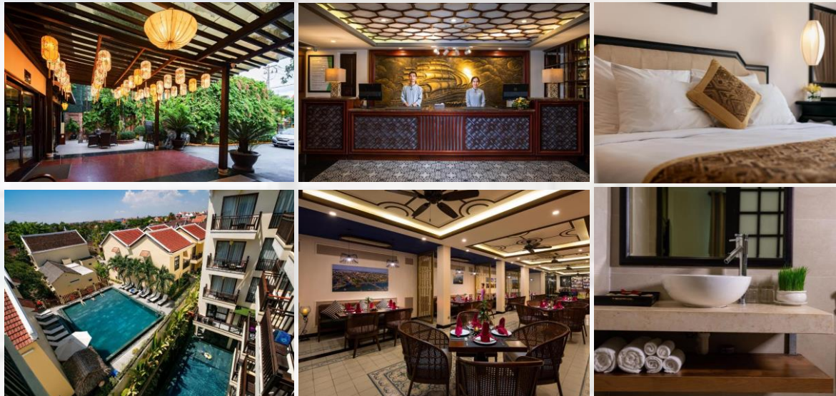
Super Deluxe 5* La Siesta Hoi An Resort