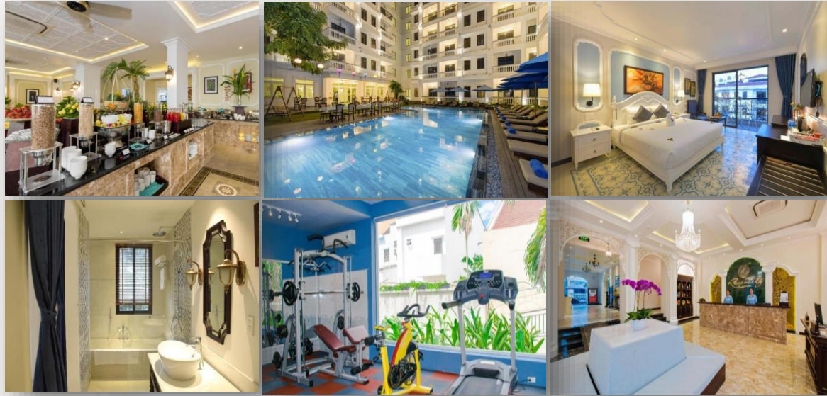
Standard 3* Rosemary Hotel