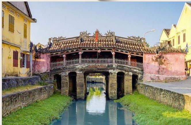
Japanese Bridge 日本桥