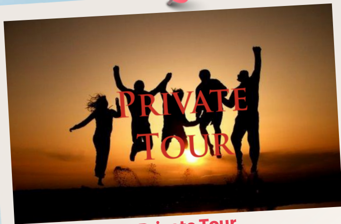
Private Tour 专属私人团