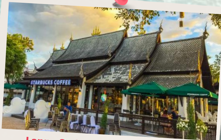
Lanna Style Buidling Starbucks Lanna风格建筑星巴克