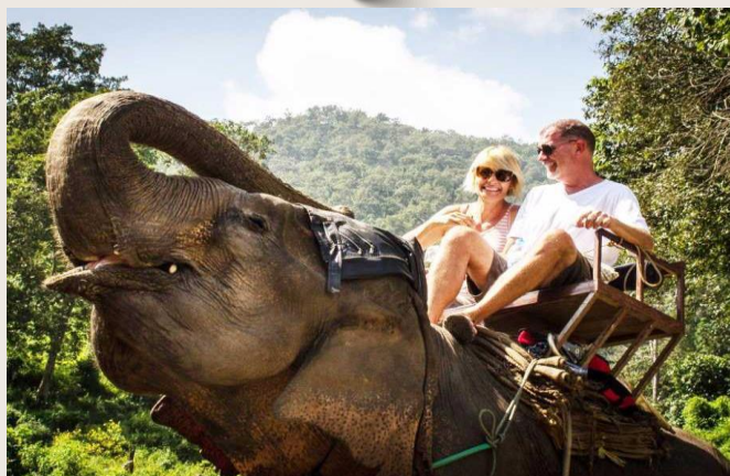
Elephant Ridding 體驗騎大象