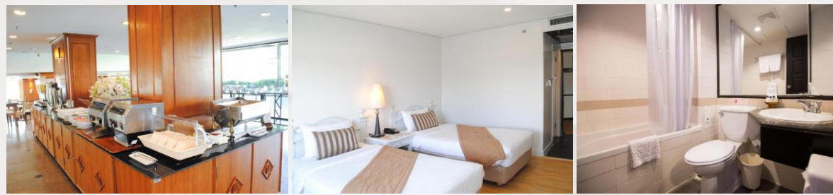
Superior 4* Duangtawan Hotel