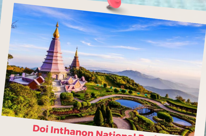
Doi Inthanon National Park 茵他侬山国家公园