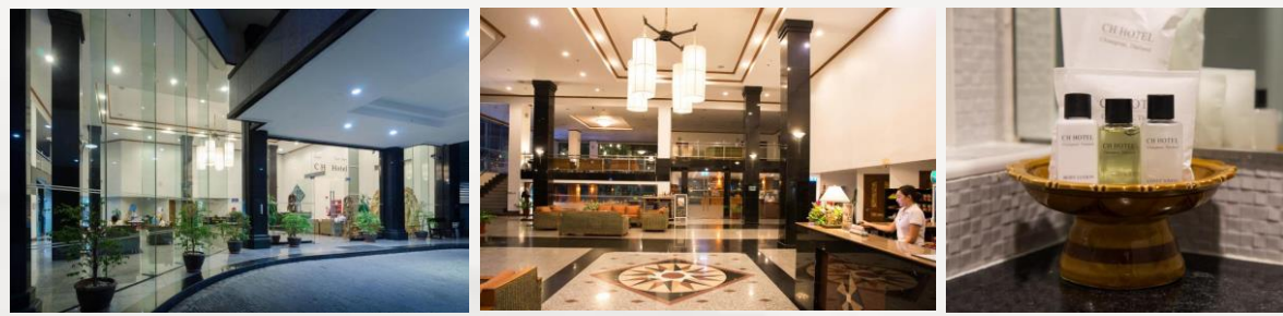
Superior 3* The CH Hotel