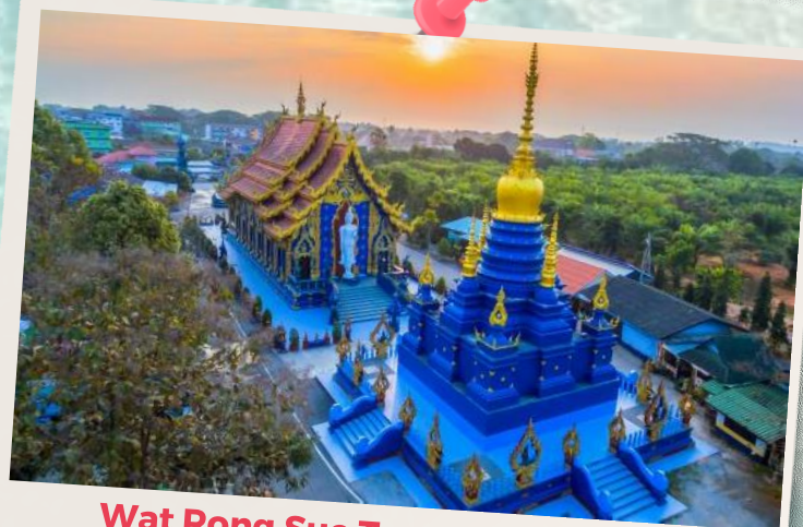
Wat Rong Sue Ten - Blue Temple 清萊藍廟