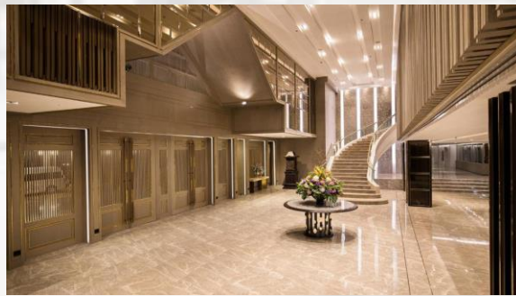
Superior 4* The Heritage Hotel