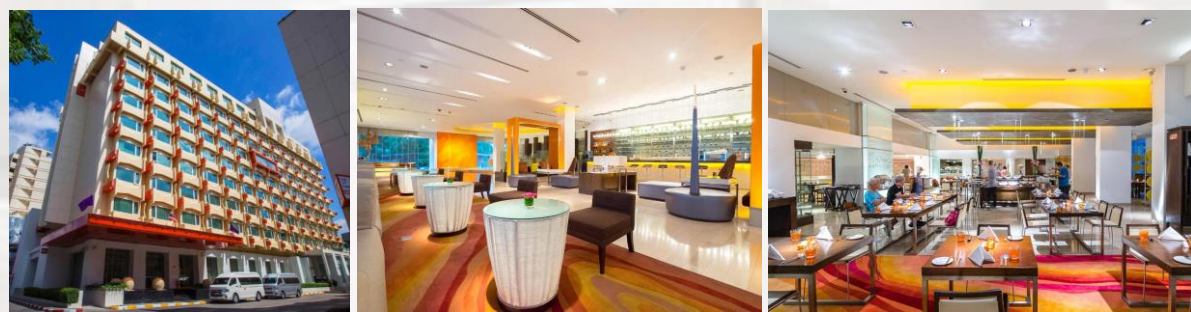
Deluxe 5* Dusit D2 Chiang Mai