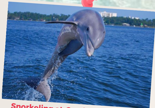
Snorkeling at 2 point & Dolphin Watching Cruise 浮潜 & 观望海豚船