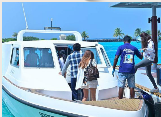
Airport transfer by Speedboat 机场快艇接送