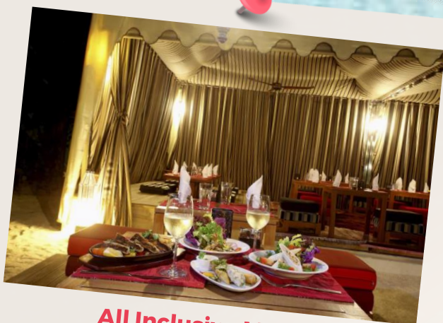
All Inclusive Meal 全包餐