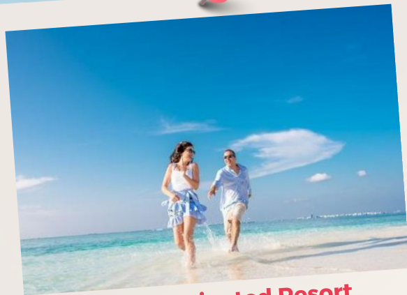
Adult Oriented Resort 仅限成人度假村