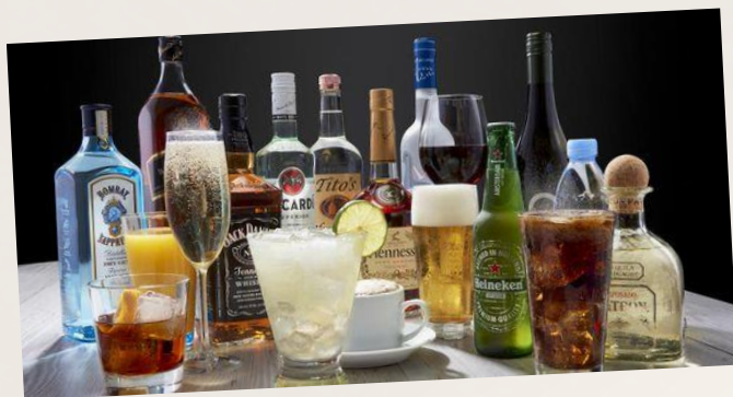
Unlimited Alcohol Drinks 无限量提供酒精饮料