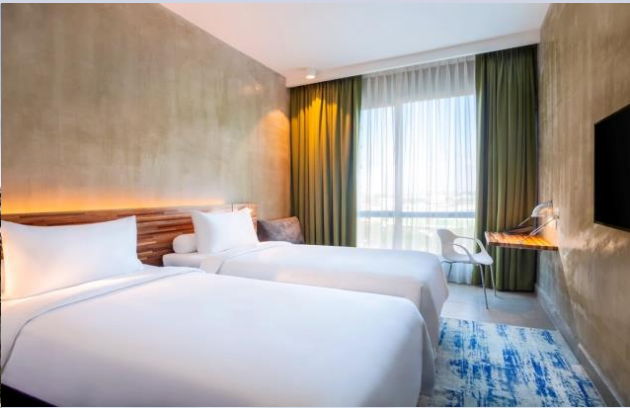
Ibis Styles Kota Kinabalu Inanam