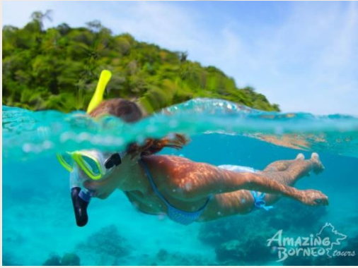
Mantanani Island Hopping 美人鱼岛浮潜