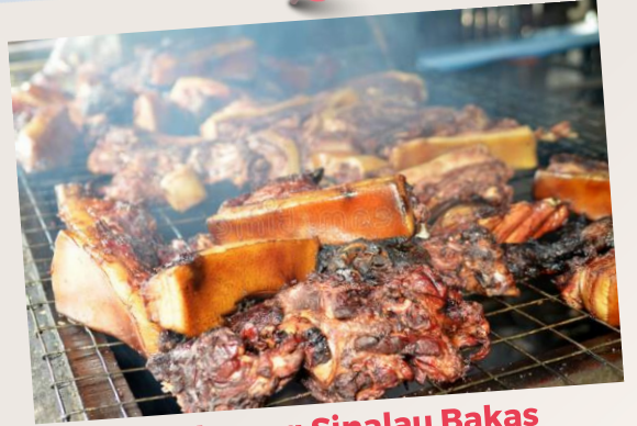
Kundasang Sinalau Bakas "Roasted Wild Boar" 烤山猪肉