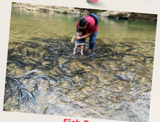
Fish Spa 天然鱼儿按摩