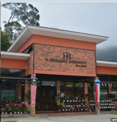
H Benjamin Hotel Kundasang

4D3N AMAZING KOTA KINABALU Travelling Period: NOW – 31 Dec 2023 4MSH-PER PAX (MYR)