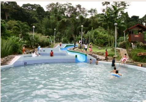
Poring Hot Spring 波令温泉