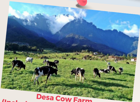
Desa Cow Farm (Included Milk + Yogurt Ice Cream) 牛牛牧场 (包含牛奶+酸奶冰淇淋)