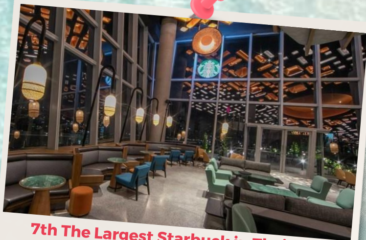
7th The Largest Starbuck in Thailand 泰国最大的星巴克