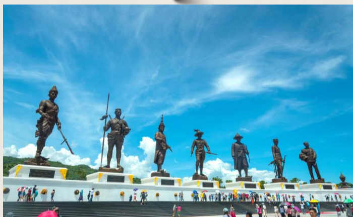
Giant King Statues 七王像