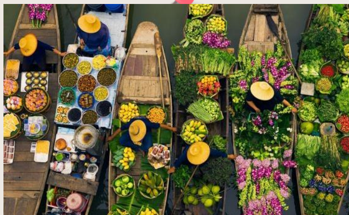
Damnoen Saduak Floating Market 原始水上市场