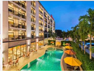
Standard 3* Ibis Hua Hin