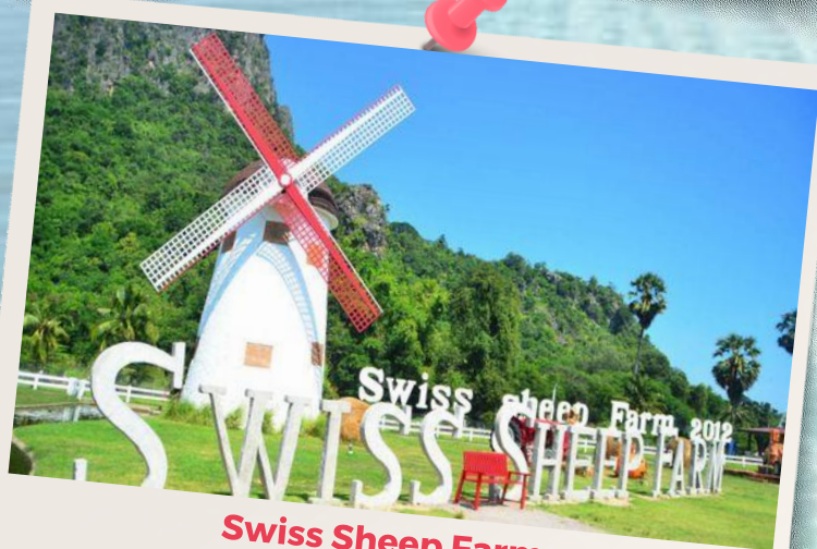
Swiss Sheep Farm 绵羊牧场