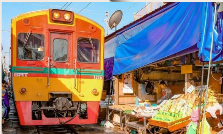
Maeklong Railway Market 美功铁道市场