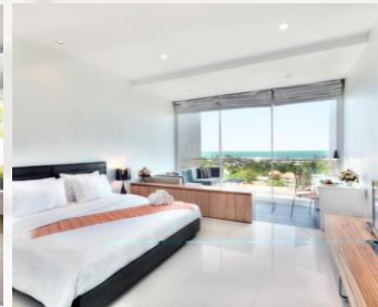
Deluxe 4* Grand Pacific Sovereign Resort