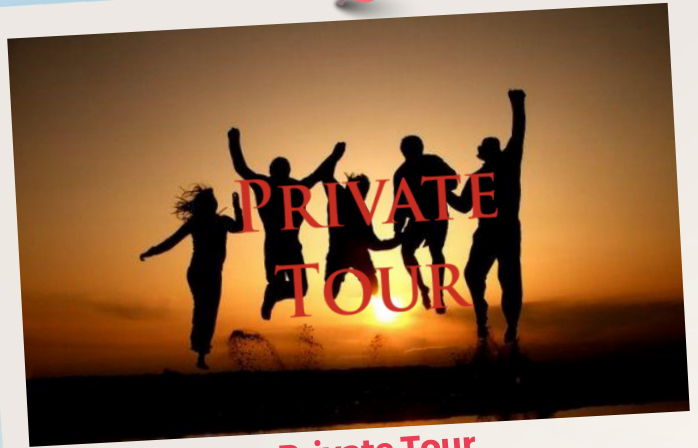
Private Tour 专属私人团