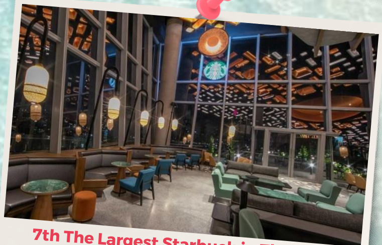
7th The Largest Starbuck in Thailand 泰国最大的星巴克