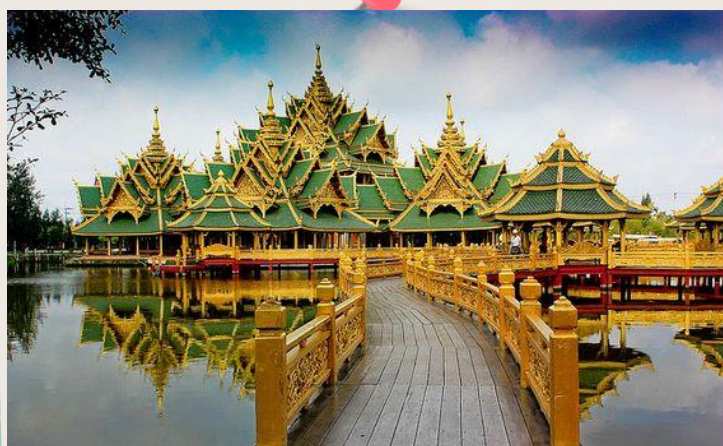
Ancient City 暹罗古城