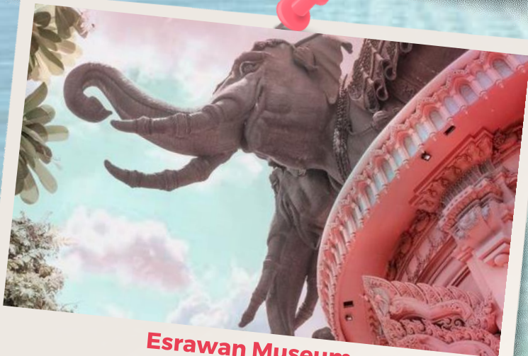
Esrawan Museum 三头神像博物馆