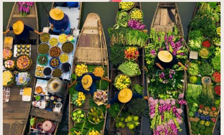
Damnoen Saduak Floating Market 原始水上市场