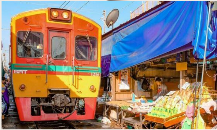
Maeklong Railway Market 美功铁道市场