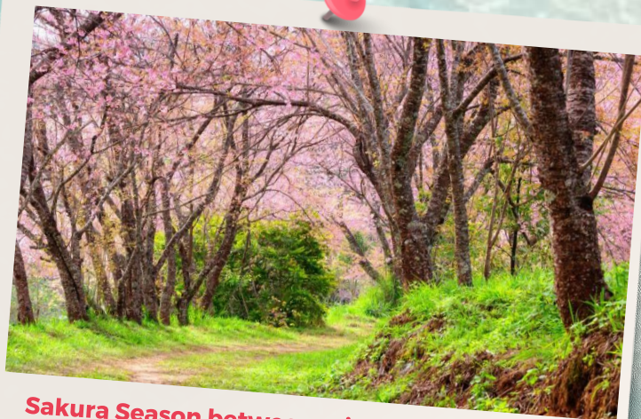
Sakura Season between mid of Dec - mid of Jan 12月中至1月中之間旅遊可觀賞櫻花