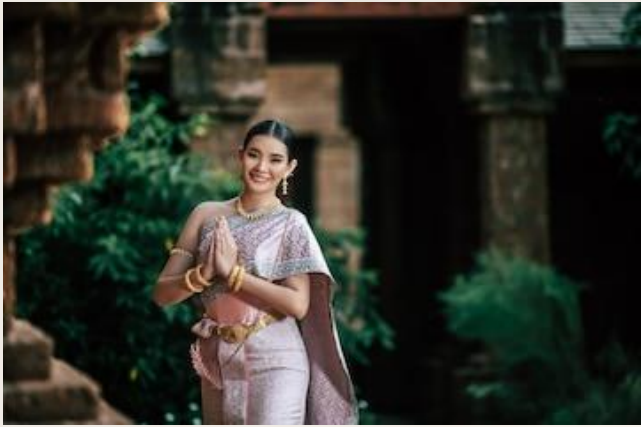
Hi-Tea with Thai Costume 下午茶和體驗傳統泰式服裝