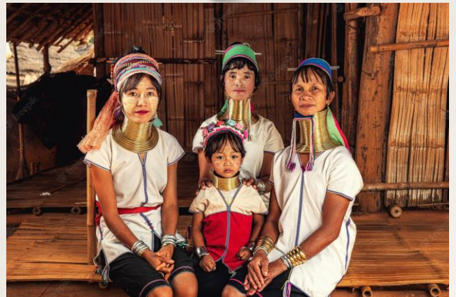
Long Neck Village 長頸族村