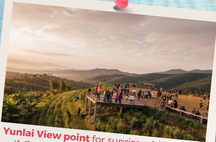
Yunlai View point for sunrise with Brunch 清晨云南山地村观景台观看日出(含早茶)