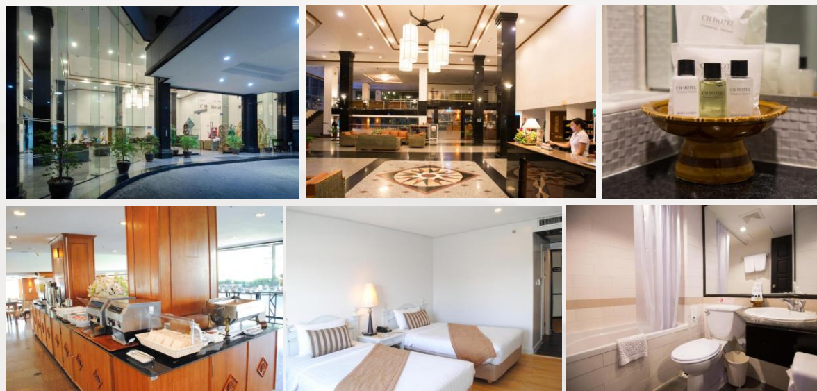
Superior 3* The CH Hotel