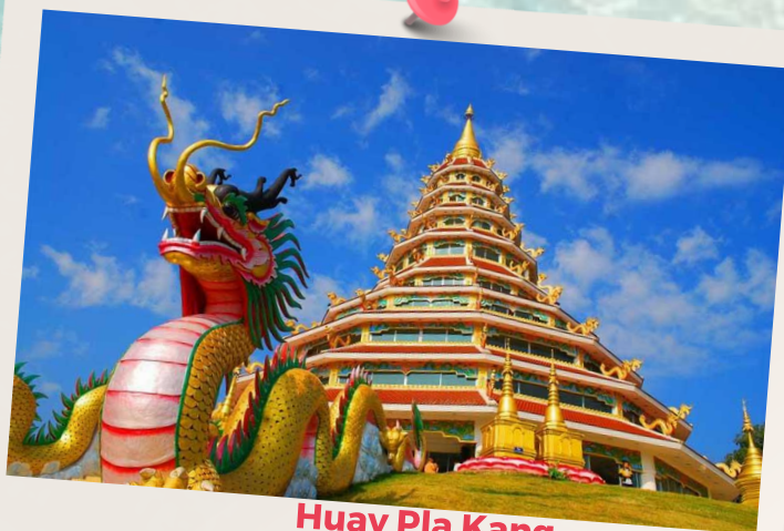
Huay Pla Kang 九層佛塔