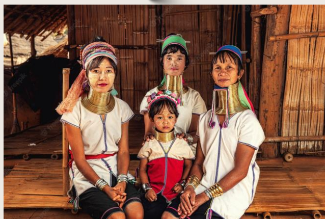
Long Neck Village 長頸族村