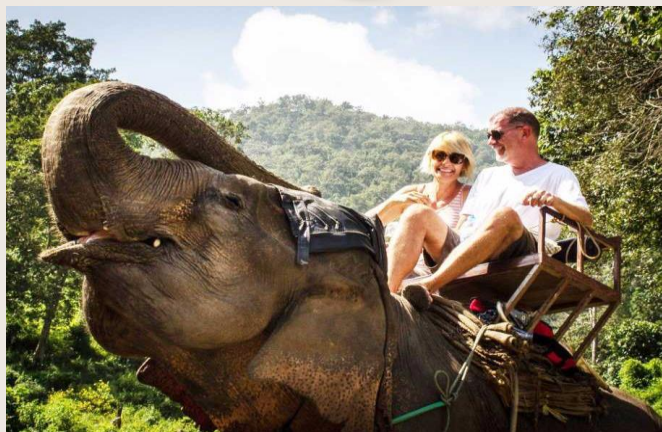
Elephant Ridding 體驗騎大象