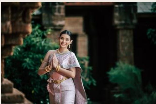
Hi-Tea with Thai Costume 下午茶和體驗傳統泰式服裝