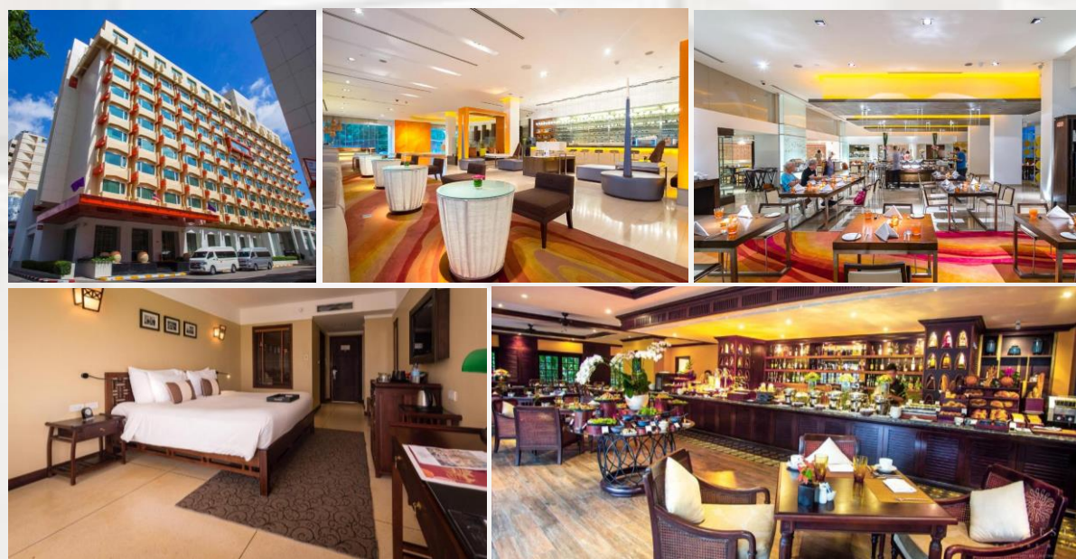
Deluxe 5* Dusit D2 Chiang Mai