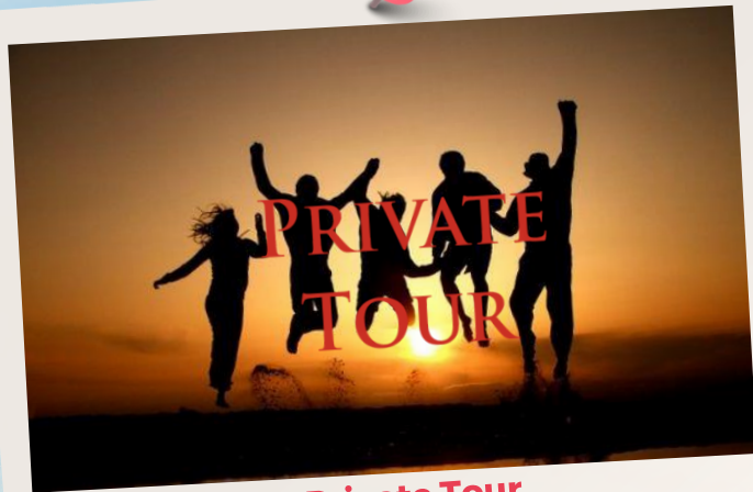
Private Tour 專屬私人團