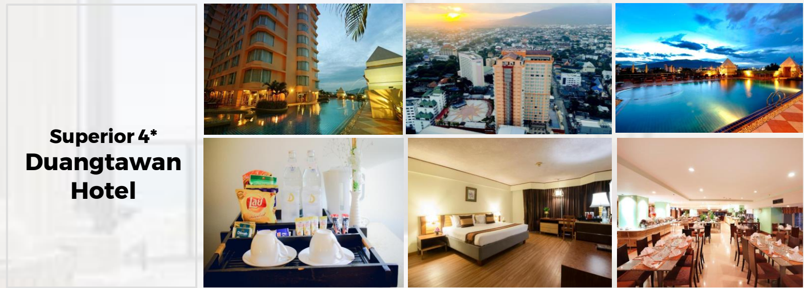
Superior 4* Duangtawan Hotel