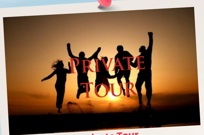
Private Tour 专属私人团