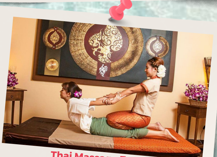
Thai Massage Experience 體驗泰式按摩