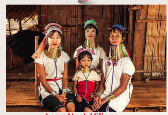
Long Neck Village 長頸族村