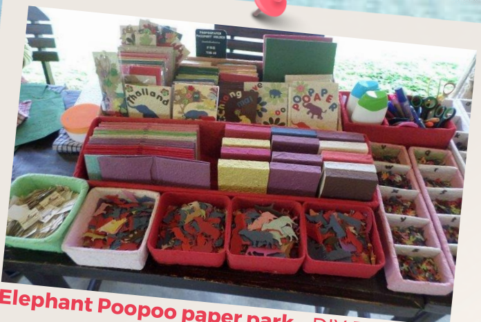
Elephant Poopoo paper park - DIY Bookmark 大象便便纸公园—手制書籤