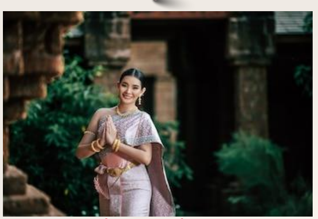
Experience Thai Costume 體驗傳統泰式服裝