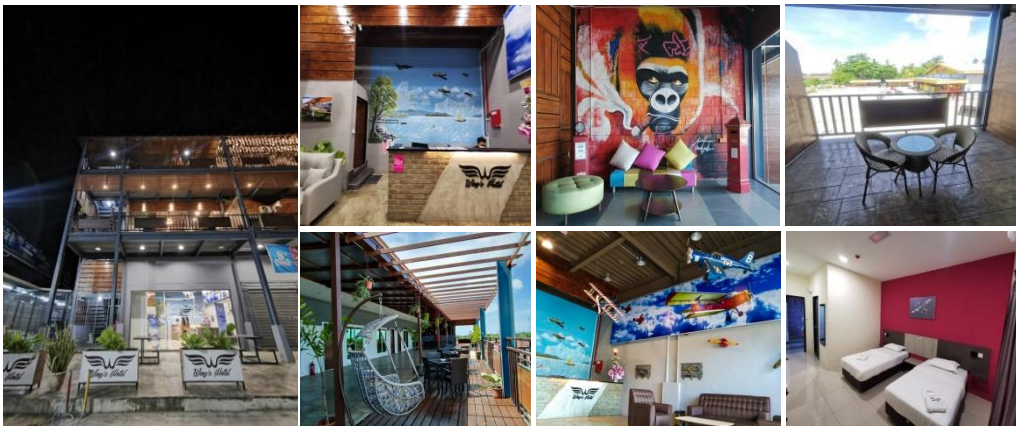
Semporna Wings Hotel