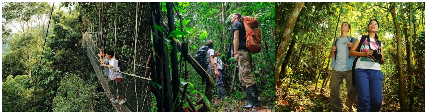
✿ 徒步丛林 & 雨林吊桥 @ Jungle Trekking & Canopy Walkway