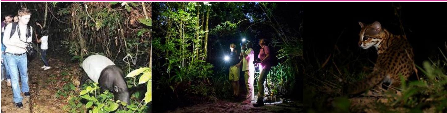
✿ 夜游丛林 @ Night Jungle Walk