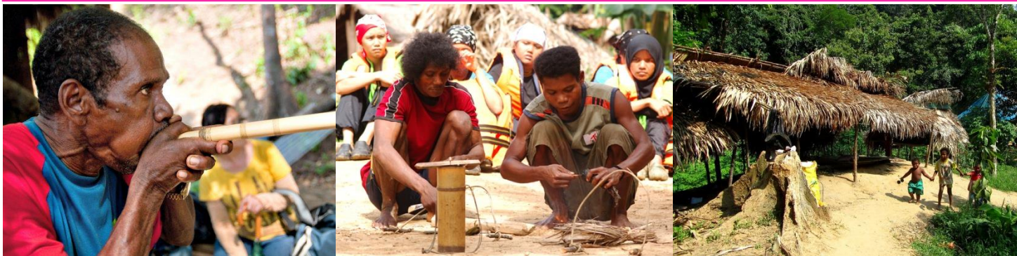
✿ 原住民村落 @ Aboriginal Settlement