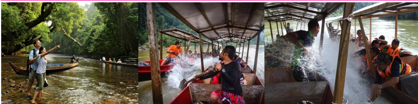
✿ 泛舟激流 @ Rapid Shooting