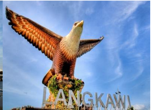
✿ 提供车辆体验自驾游~自己安排行程 @ Provide Vehicle Self Drive in Langkawi