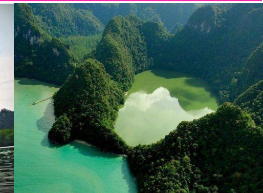
✿ 经典兰卡威跳岛游 @ Langkawi Island Hopping