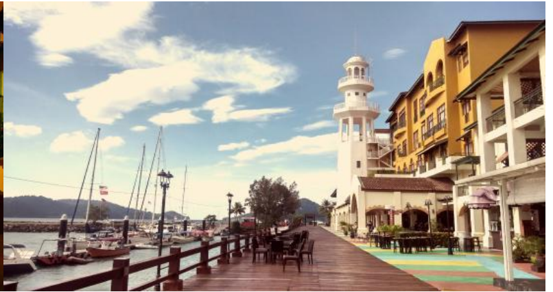
✿ 兰卡威世界度假村 (含早餐) @ Resort World Langkawi (With Breakfast)