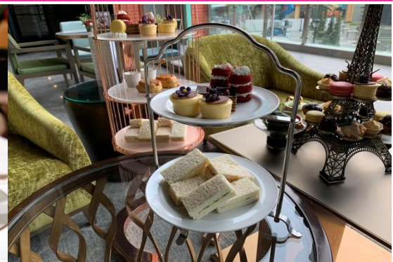
✿ 特别安排 酒店浪漫下午茶体验 @ Special Arrange Romantic Hi-Tea