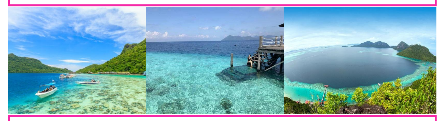
● Option 1 珍珠岛/曼达布安岛/军舰岛 @ Bohey Dulang Island / Mantabuan Island / Sibuan Island