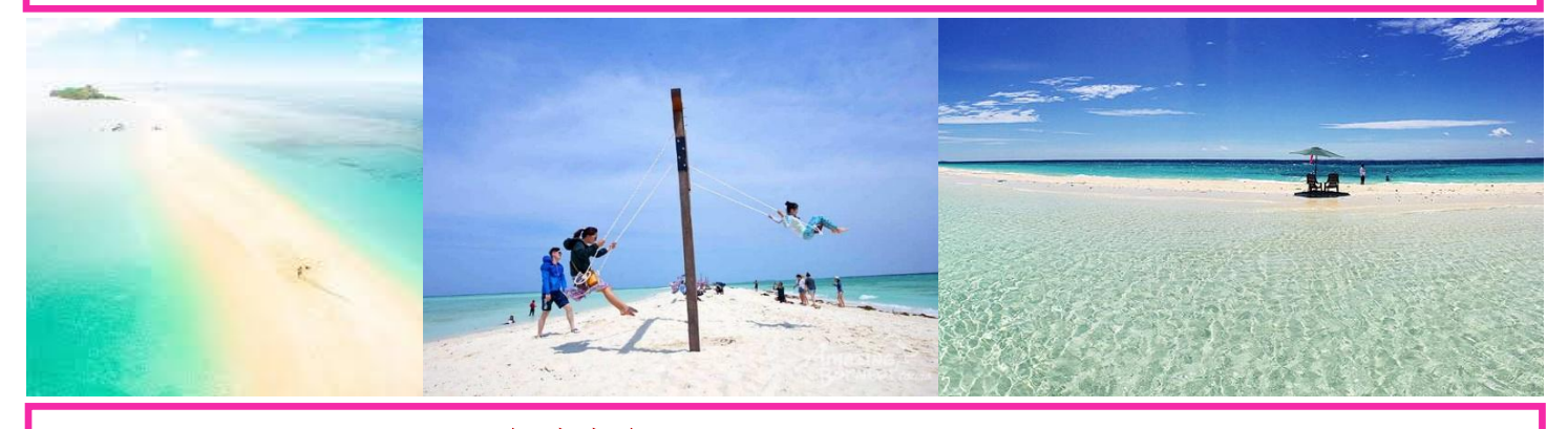
● Option 3 马达京岛/汀巴汀巴岛/邦邦岛 @ Mataking Island / Timba-Timba Island / Pompom Island