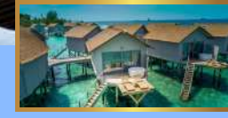
Deluxe Spa Over Water Villa