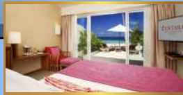
Ocean Front Beach Villa