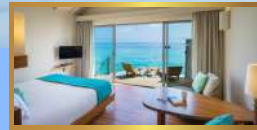
Deluxe Water Villa